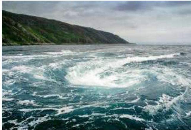
Kelpies and the Whirlpool at Corryvreckan St Columba and the Loch Ness Monster