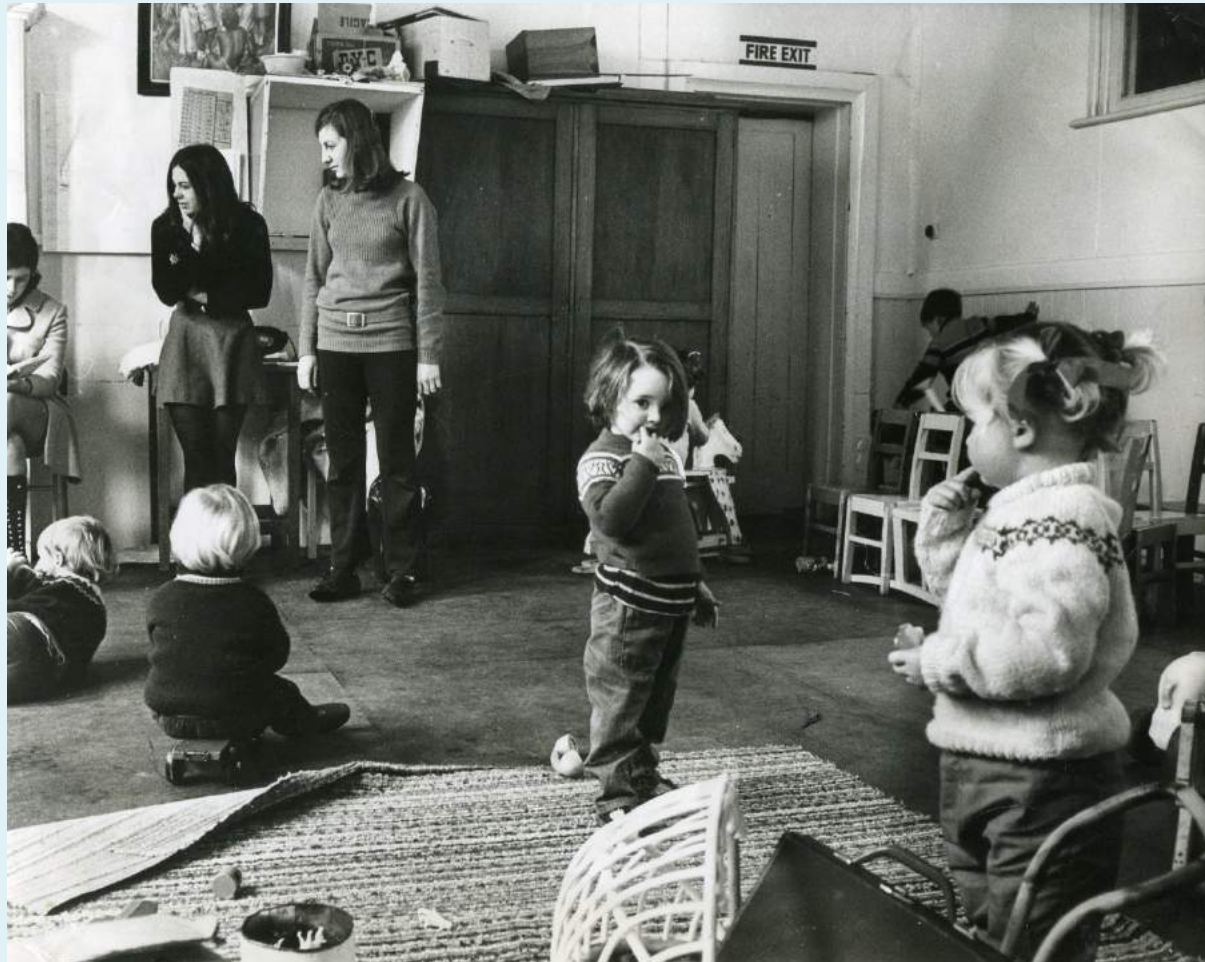
The university crèche in its original premises in the old All Saints Church Hall, with voluntary helpers at the back.