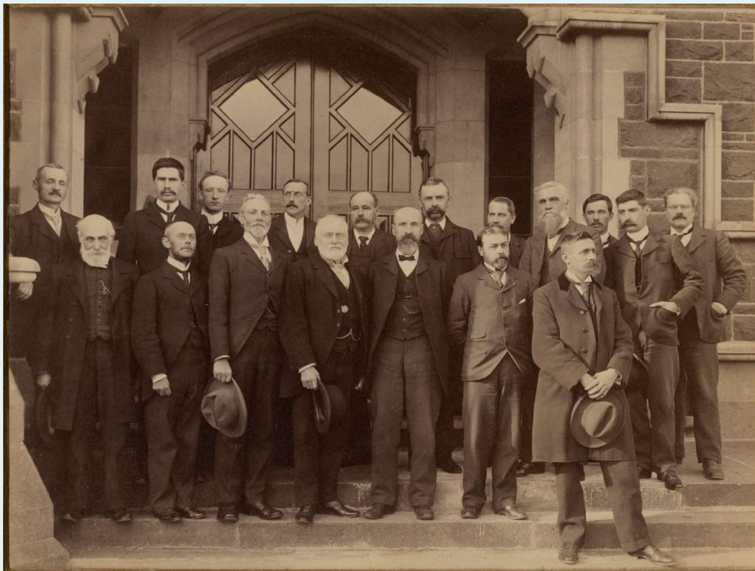
University of Otago staff and council members in 1902.