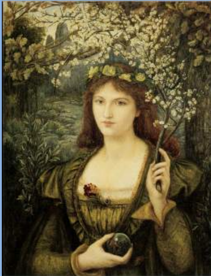
Marie Spartali Stillman, Madonna Pietra degli Scrovegni , 1884; Walker Art Gallery, Liverpool, UK