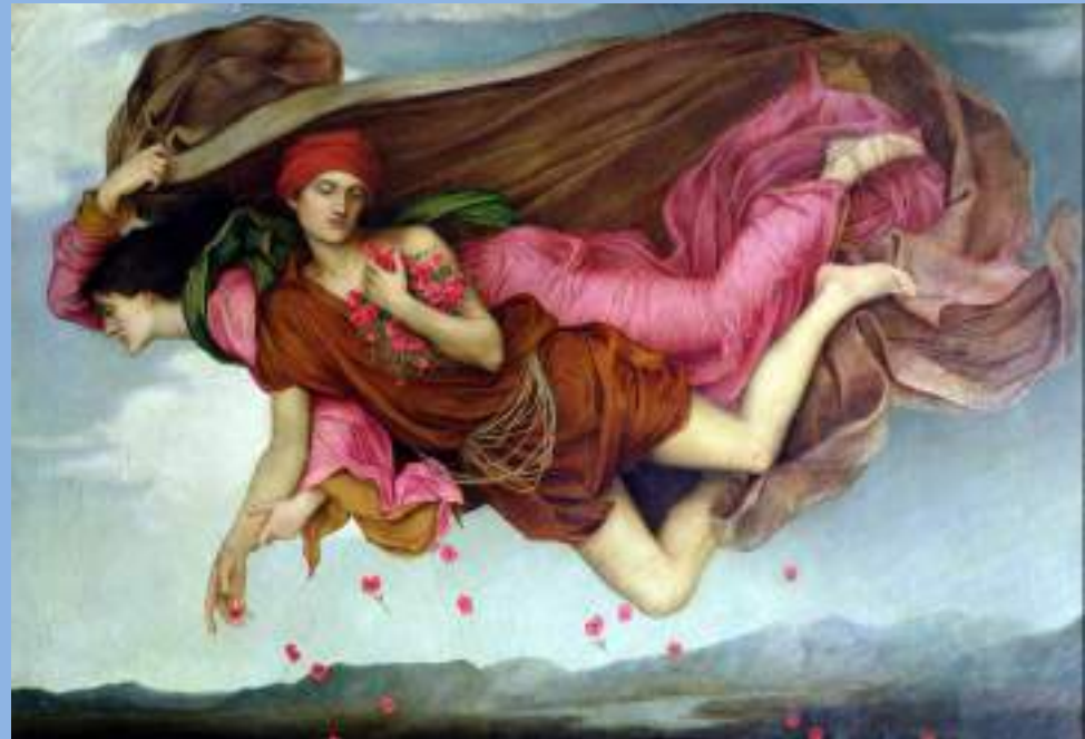
Evelyn De Morgan, Night and Sleep , 1878; Wightwick Manor, Wolverhampton, UK